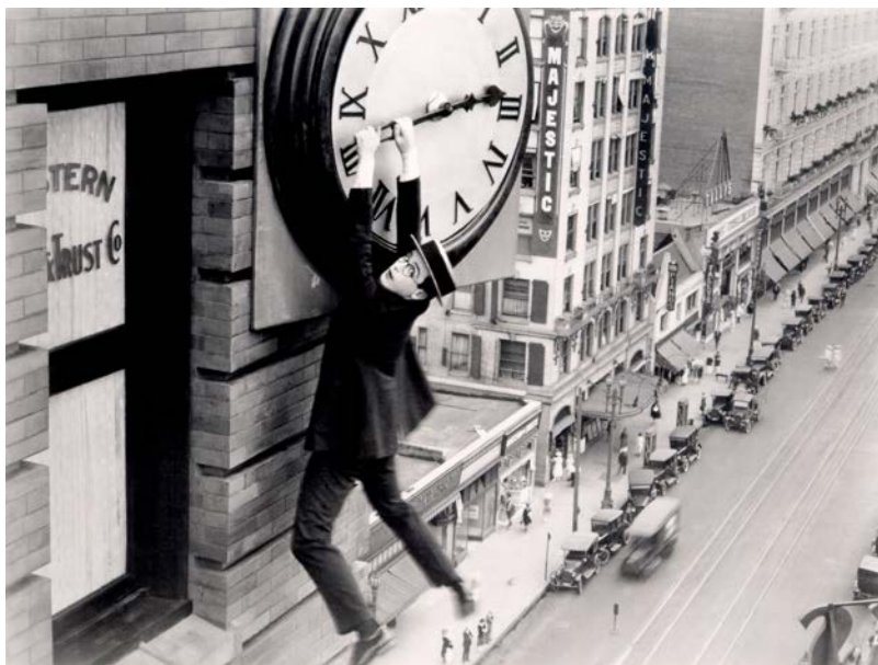
[“Safety Last” starring Harold Lloyd, 1923]

The best advice I have for succeeding in the course is to work through problems and not to be left hanging when it comes to studying ... don't leave things to the last minute.